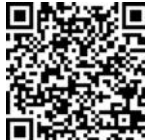
Village Venture Fillingham SCAN ME

OR with a QR Code Scan App on your mobile