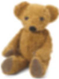
What they see