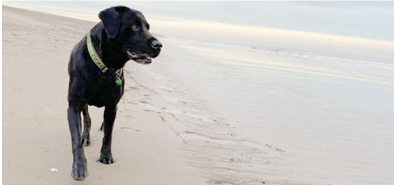
© 'Bomber' - Image courtesy of Walter Robinson