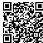
Village Venture Fillingham P. Council SCAN ME

OR with a QR Code Scan App on your mobile SCAN one of these QR Codes