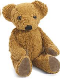
What you see